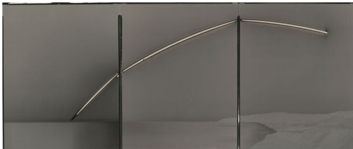
Chris McCaw | Sunburned GSP#733 (Pacific Ocean), 2013

creation. His scorched photographs recall the sentiments of Talbot: “It is not the artist who makes the picture, but the picture which makes itself ” (qtd in Silverman 10).