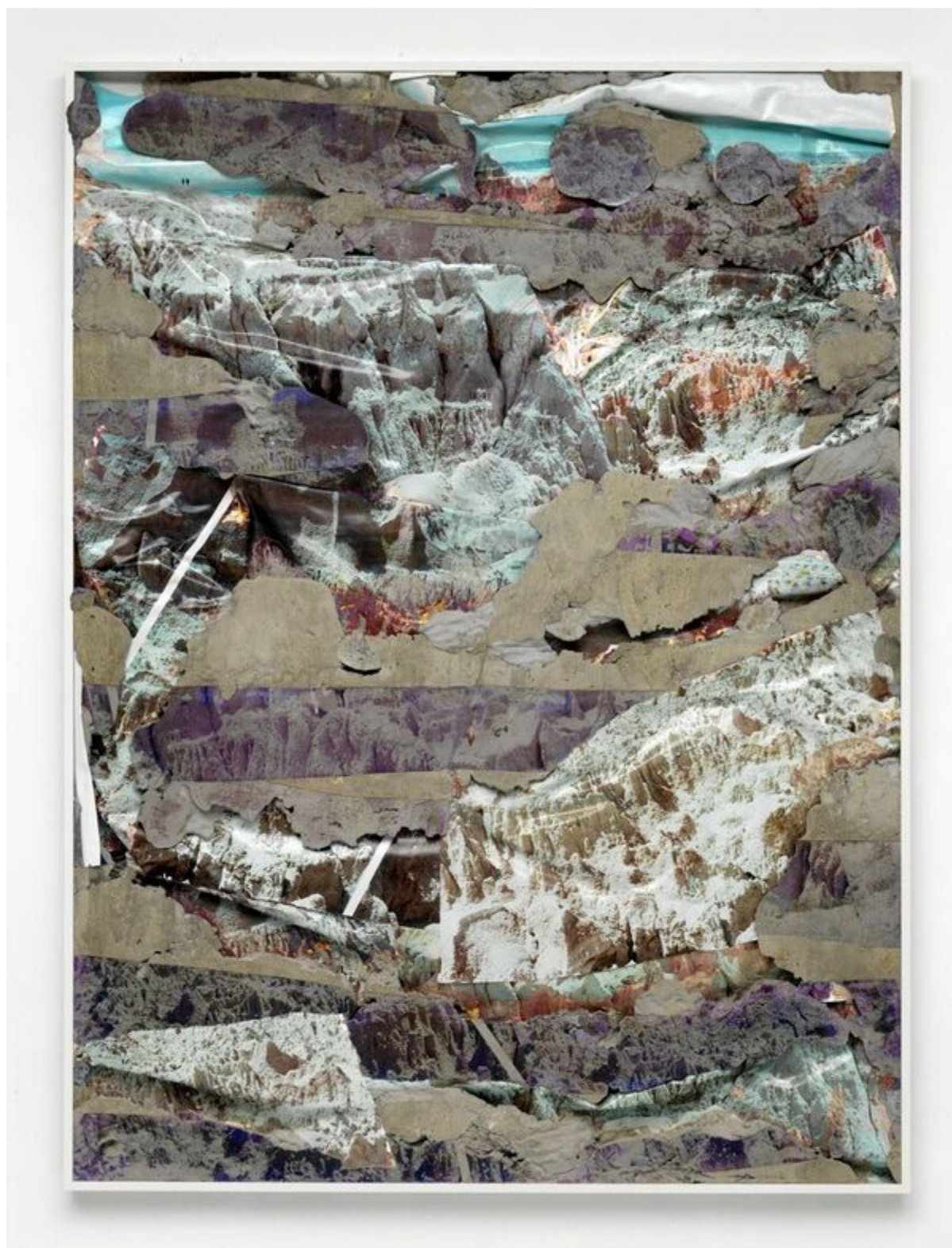
Letha Wilson, Badlands Concrete Bend, 2015 | C-prints, concrete, emulsion transfer, aluminium frame